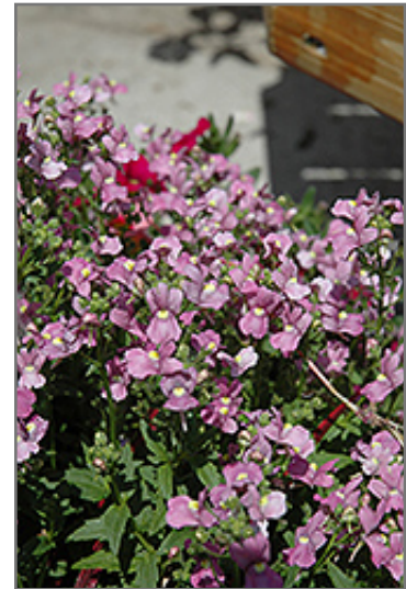
Compact Pink Innocence Nemesia flowers