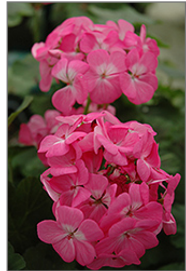
Pillar Pink Geranium flowers