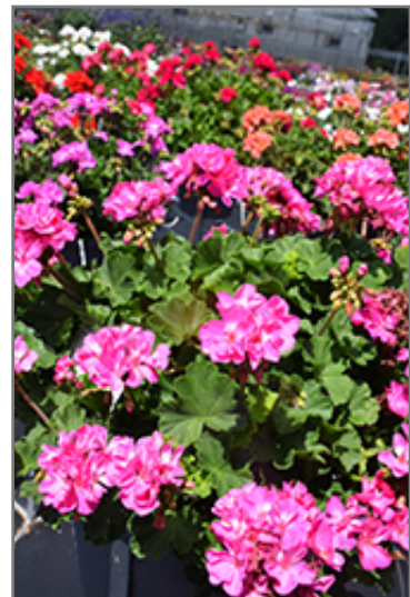
Fantasia Shocking Pink Geranium in bloom