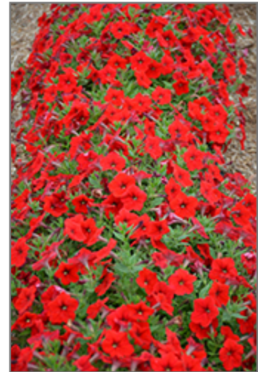
Easy Wave Red Petunia in bloom

Easy Wave Red Petunia is a fine choice for the garden, but it is also a good selection for planting in outdoor containers and hanging baskets. Because of its trailing habit of growth, it is ideally suited for use as a 'spiller' in the 'spiller-thriller-filler' container combination; plant it near the edges where it can spill gracefully over the pot. Note that when growing plants in outdoor containers and baskets, they may require more frequent waterings than they would in the yard or garden.