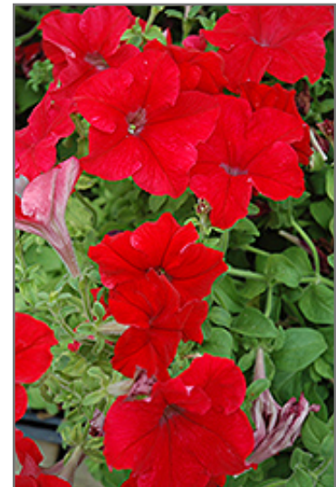
Dreams Red Petunia flowers