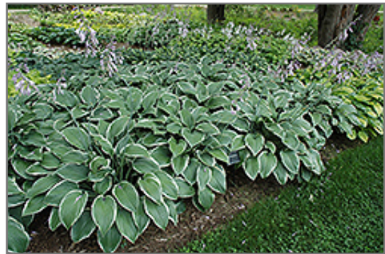
Winter Snow Hosta in bloom

Moana Lane Garden Center & Corporate Office 1100 W. Moana Lane Reno, NV 89509 (775) 825-0600 (775) 825-0602 - Corporate Office