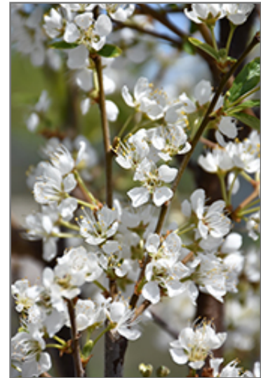
Toka Plum flowers