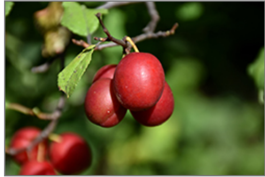
Toka Plum fruit

Toka Plum is blanketed in stunning clusters of fragrant white flowers along the branches in early spring before the leaves. It has forest green deciduous foliage. The pointy leaves turn yellow in fall. The fruits are showy crimson drupes carried in abundance in late summer. The fruit can be messy if allowed to drop on the lawn or walkways, and may require occasional clean-up.