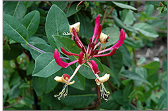
Peaches And Cream Honeysuckle flowers

Peaches And Cream Honeysuckle is recommended for the following landscape applications;