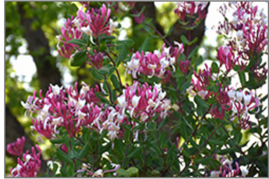
Peaches And Cream Honeysuckle flowers

Peaches And Cream Honeysuckle will grow to be about 20 feet tall at maturity, with a spread of 24 inches. As a climbing vine, it tends to be leggy near the base and should be underplanted with low-growing facer plants. It should be planted near a fence, trellis or other landscape structure where it can be trained to grow upwards on it, or allowed to trail off a retaining wall or slope. It grows at a medium rate, and under ideal conditions can be expected to live for approximately 20 years.