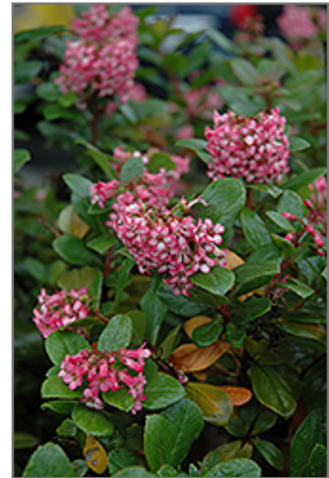
Newport Dwarf Escallonia flowers

Newport Dwarf Escallonia is recommended for the following landscape applications;