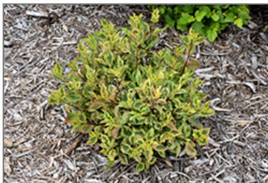
Rainbow Sensation Weigela

Rainbow Sensation Weigela makes a fine choice for the outdoor landscape, but it is also well-suited for use in outdoor pots and containers. Because of its height, it is often used as a 'thriller' in the 'spiller-thriller-filler' container combination; plant it near the center of the pot, surrounded by smaller plants and those that spill over the edges. It is even sizeable enough that it can be grown alone in a suitable container. Note that when grown in a container, it may not perform exactly as indicated on the tag - this is to be expected. Also note that when growing plants in outdoor containers and baskets, they may require more frequent waterings than they would in the yard or garden.