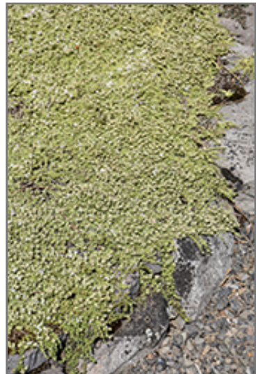
Highland Cream Creeping Thyme

Moana Lane Garden Center & Corporate Office 1100 W. Moana Lane Reno, NV 89509 (775) 825-0600 (775) 825-0602 - Corporate Office