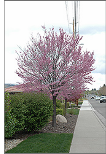
Eastern Redbud (tree form) in bloom

This tree does best in full sun to partial shade. It prefers to grow in average to moist conditions, and shouldn't be allowed to dry out. It may require supplemental watering during periods of drought or extended heat. It is not particular as to soil type or pH. It is highly tolerant of urban pollution and will even thrive in inner city environments, and will benefit from being planted in a relatively sheltered location. Consider applying a thick mulch around the root zone in winter to protect it in exposed locations or colder microclimates. This is a selection of a native North American species.