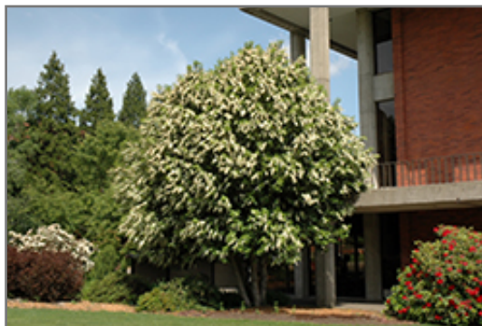
Portugal Laurel in bloom