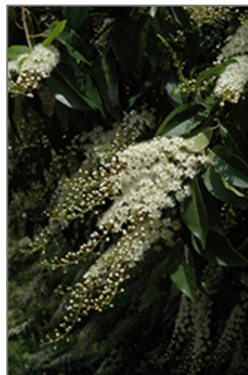
Portugal Laurel flowers