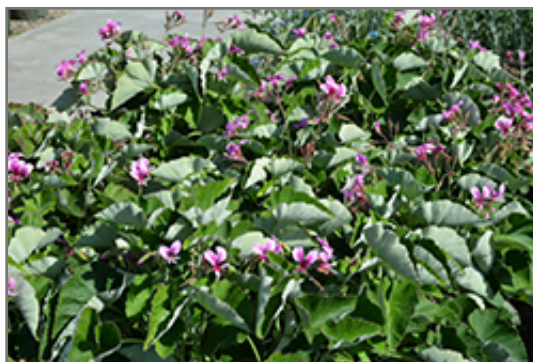
Heartleaf Geranium in bloom