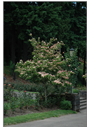
Heart Throb Chinese Dogwood in bloom