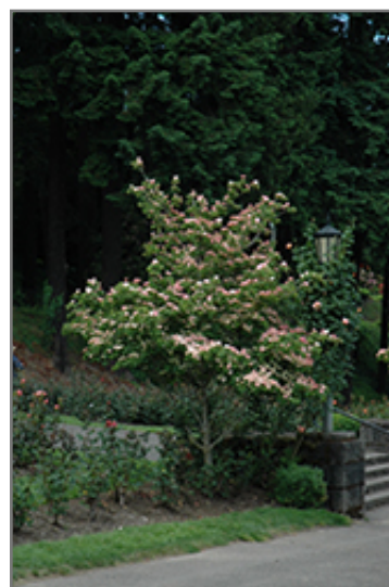
Heart Throb Chinese Dogwood in bloom