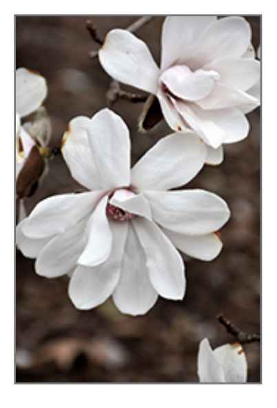
Merrill Magnolia flowers