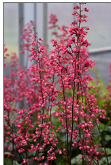
Paris Coral Bells flowers