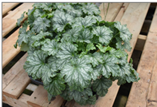
Paris Coral Bells foliage

Paris Coral Bells will grow to be about 8 inches tall at maturity extending to 14 inches tall with the flowers, with a spread of 14 inches. When grown in masses or used as a bedding plant, individual plants should be spaced approximately 12 inches apart. Its foliage tends to remain low and dense right to the ground. It grows at a medium rate, and under ideal conditions can be expected to live for approximately 10 years. As an evergreen perennial, this plant will typically keep its form and foliage year-round.