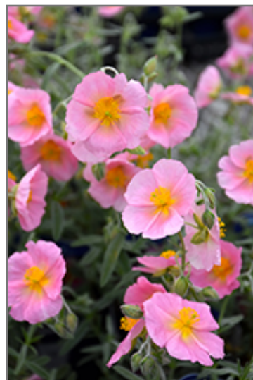
Wisley Pink Rock Rose flowers

Wisley Pink Rock Rose is recommended for the following landscape applications;