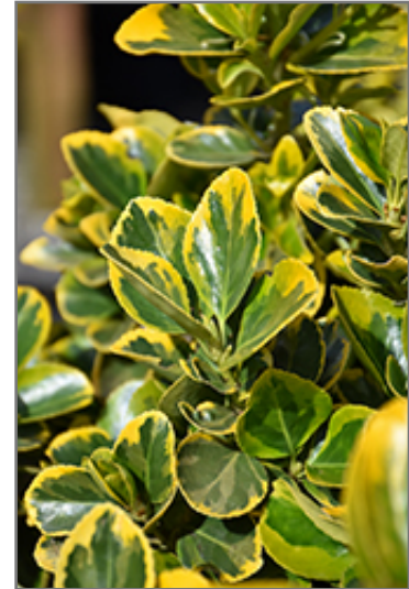
Gold Variegated Japanese Euonymus foliage