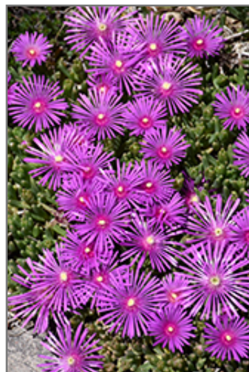
Purple Ice Plant flowers

Purple Ice Plant is recommended for the following landscape applications;