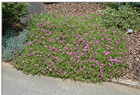
Purple Ice Plant in bloom

Purple Ice Plant will grow to be only 2 inches tall at maturity extending to 3 inches tall with the flowers, with a spread of 24 inches. Its foliage tends to remain low and dense right to the ground. It grows at a fast rate, and under ideal conditions can be expected to live for approximately 5 years. As an evergreen perennial, this plant will typically keep its form and foliage year-round.