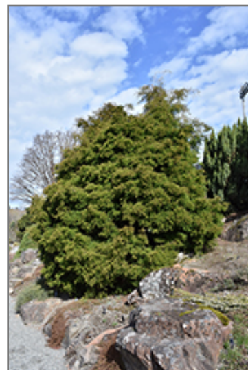
Coralliformis Dwarf Hinoki Falsecypress