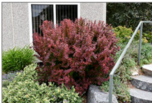
Orange Rocket Japanese Barberry