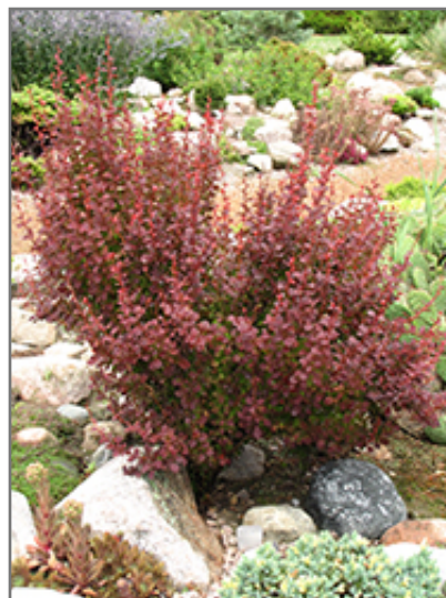
Orange Rocket Japanese Barberry

This shrub does best in full sun to partial shade. It is very adaptable to both dry and moist growing conditions, but will not tolerate any standing water. It may require supplemental watering during periods of drought or extended heat. It is not particular as to soil type or pH, and is able to handle environmental salt. It is highly tolerant of urban pollution and will even thrive in inner city environments. Consider applying a thick mulch around the root zone in both summer and winter to conserve soil moisture and protect it in exposed locations or colder microclimates. This is a selected variety of a species not originally from North America.