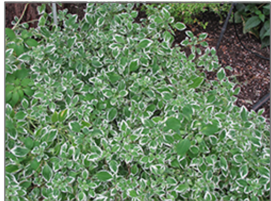
Variegated Parrot Feather