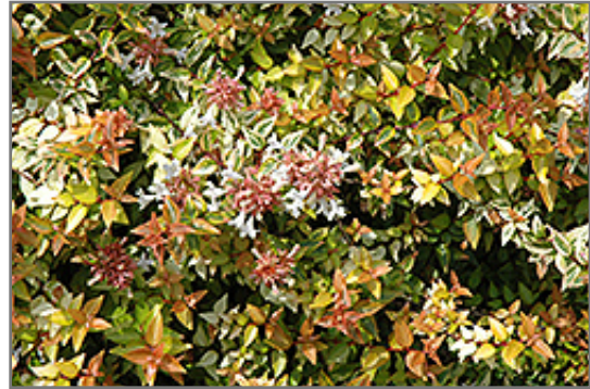
Kaleidoscope Abelia flowers

This shrub will require occasional maintenance and upkeep, and should only be pruned after flowering to avoid removing any of the current season's flowers. It is a good choice for attracting birds, bees and butterflies to your yard, but is not particularly attractive to deer who tend to leave it alone in favor of tastier treats. It has no significant negative characteristics.