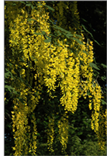
Weeping Laburnum flowers