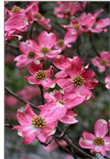
Cherokee Chief Flowering Dogwood flowers

This is a relatively low maintenance tree, and usually looks its best without pruning, although it will tolerate pruning. It is a good choice for attracting birds to your yard. Gardeners should be aware of the following characteristic(s) that may warrant special consideration;