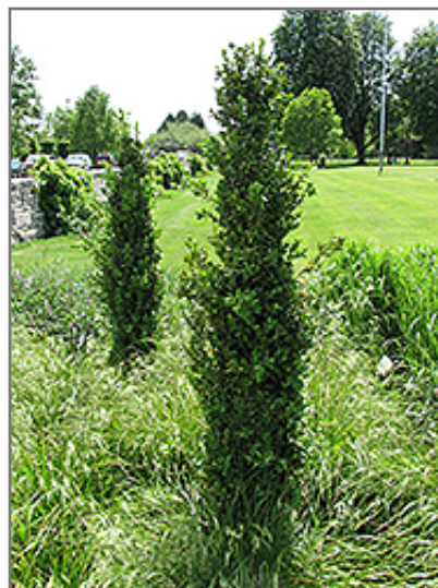
Graham Blandy Boxwood