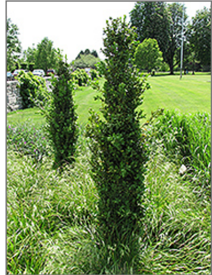
Graham Blandy Boxwood