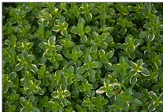
Variegated Broadleaf Thyme foliage