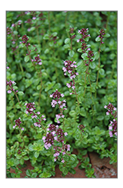
Broadleaf Thyme flowers

A highly desirable and popular groundcover, forming a dense low mat with spikes of lilac-white flowers throughout summer, attractive and fragrant foliage that is larger and more broadleaf; needs a dry and sunny location, can take light foot traffic