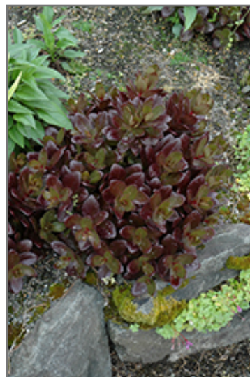
Chocolate Drop Stonecrop

Chocolate Drop Stonecrop is a dense herbaceous perennial with an upright spreading habit of growth. Its relatively coarse texture can be used to stand it apart from other garden plants with finer foliage.