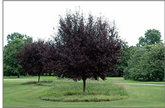
Krauter Vesuvius Plum

This tree should only be grown in full sunlight. It does best in average to evenly moist conditions, but will not tolerate standing water. It may require supplemental watering during periods of drought or extended heat. It is not particular as to soil type or pH. It is highly tolerant of urban pollution and will even thrive in inner city environments. Consider applying a thick mulch around the root zone in both summer and winter to conserve soil moisture and protect it in exposed locations or colder microclimates. This is a selected variety of a species not originally from North America.