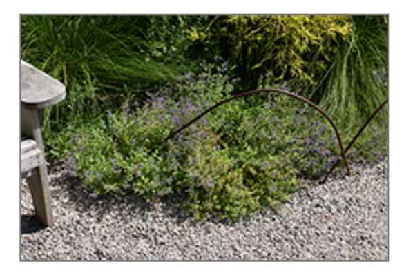
Kit Kat Catmint in bloom