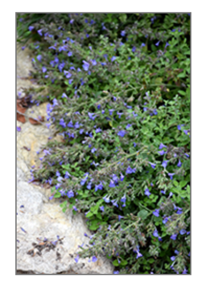
Kit Kat Catmint in bloom