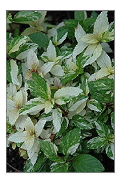
Variegated Peppermint foliage