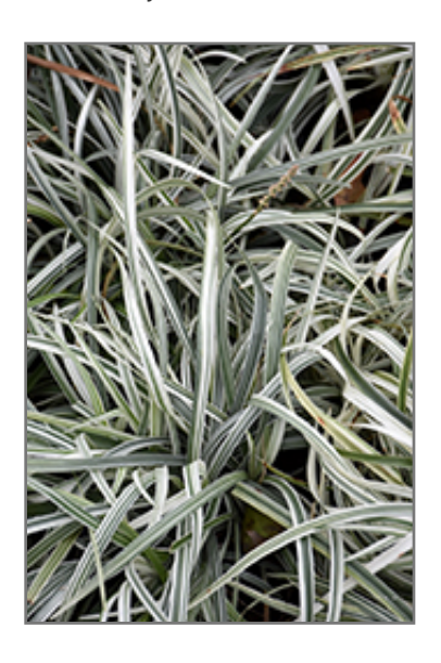
Silver Dragon Lily Turf