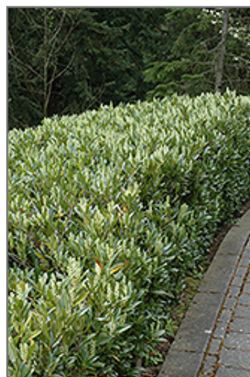
Otto Luyken Dwarf Cherry Laurel in bloom