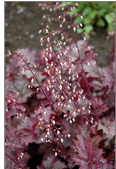
Amethyst Mist Coral Bells flowers