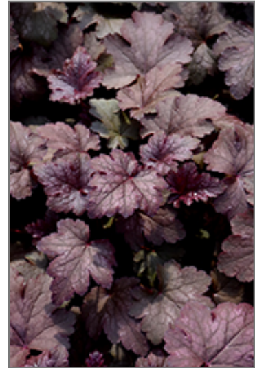
Amethyst Mist Coral Bells foliage

Amethyst Mist Coral Bells is recommended for the following landscape applications;