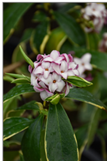
Fragrant Variegated Winter Daphne flowers

Fragrant Variegated Winter Daphne is recommended for the following landscape applications;