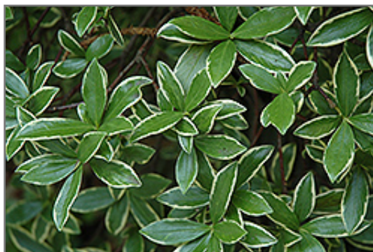
Fragrant Variegated Winter Daphne foliage

Fragrant Variegated Winter Daphne makes a fine choice for the outdoor landscape, but it is also well-suited for use in outdoor pots and containers. It can be used either as 'filler' or as a 'thriller' in the 'spiller-thriller-filler' container combination, depending on the height and form of the other plants used in the container planting. It is even sizeable enough that it can be grown alone in a suitable container. Note that when grown in a container, it may not perform exactly as indicated on the tag - this is to be expected. Also note that when growing plants in outdoor containers and baskets, they may require more frequent waterings than they would in the yard or garden. Be aware that in our climate, this plant may be too tender to survive the winter if left outdoors in a container. Contact our experts for more information on how to protect it over the winter months.