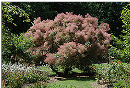
Grace Smokebush in bloom

Grace Smokebush is recommended for the following landscape applications;