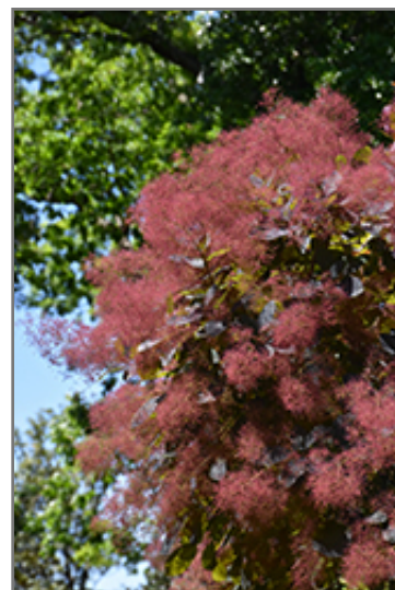
Grace Smokebush flowers