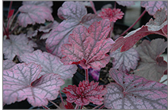
Midnight Bayou Coral Bells foliage

Midnight Bayou Coral Bells is recommended for the following landscape applications;