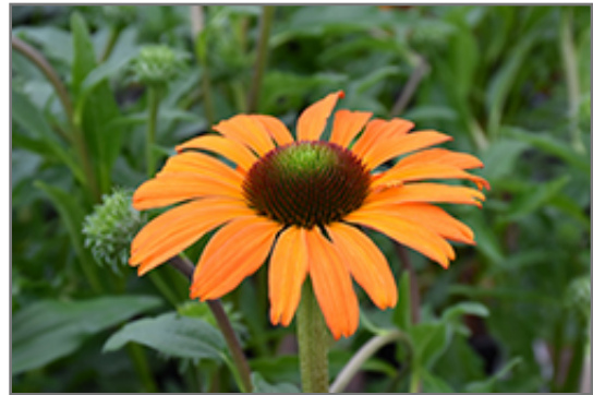
Tangerine Dream Coneflower flowers

Tangerine Dream Coneflower is recommended for the following landscape applications;