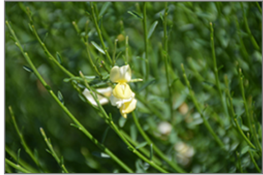
Moonlight Scotch Broom flowers

This shrub should only be grown in full sunlight. It prefers dry to average moisture levels with very well-drained soil, and will often die in standing water. It may require supplemental watering during periods of drought or extended heat. It is particular about its soil conditions, with a strong preference for clay, alkaline soils, and is able to handle environmental salt. It is highly tolerant of urban pollution and will even thrive in inner city environments. Consider applying a thick mulch around the root zone in both summer and winter to conserve soil moisture and protect it in exposed locations or colder microclimates. This is a selected variety of a species not originally from North America.