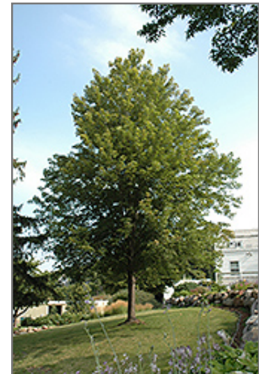
Celebration Maple