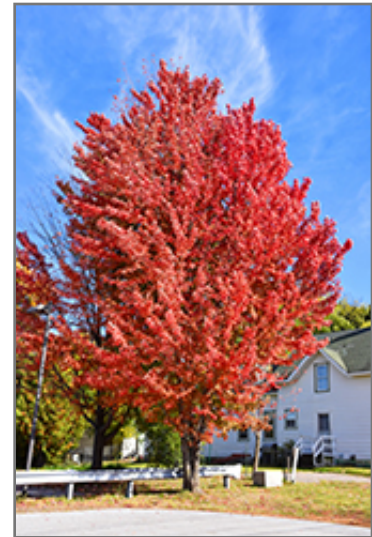
Celebration Maple in fall