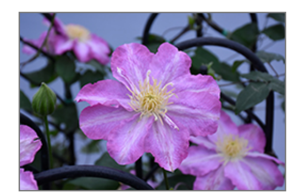
Asao Clematis flowers