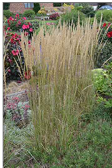
El Dorado Feather Reed Grass

El Dorado Feather Reed Grass is recommended for the following landscape applications;