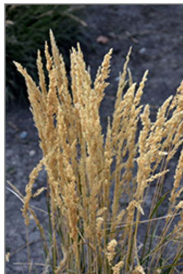
El Dorado Feather Reed Grass fruit

El Dorado Feather Reed Grass is a fine choice for the garden, but it is also a good selection for planting in outdoor pots and containers. Because of its height, it is often used as a 'thriller' in the 'spiller-thriller-filler' container combination; plant it near the center of the pot, surrounded by smaller plants and those that spill over the edges. It is even sizeable enough that it can be grown alone in a suitable container. Note that when growing plants in outdoor containers and baskets, they may require more frequent waterings than they would in the yard or garden.