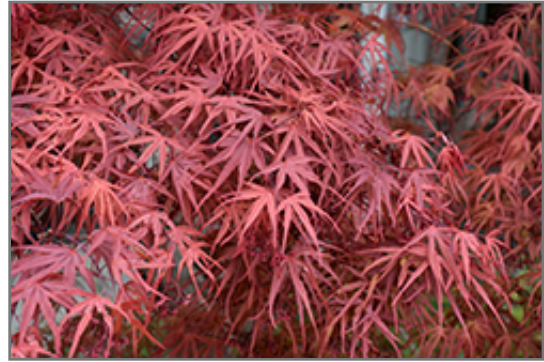
Beni Otake Japanese Maple foliage