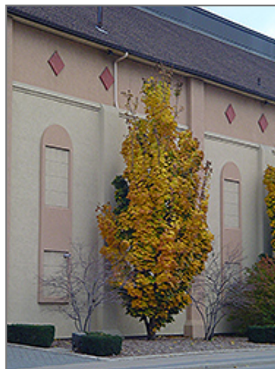
Columnar Norway Maple in fall