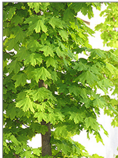
Columnar Norway Maple foliage