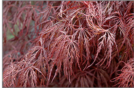
Crimson Queen Japanese Maple foliage

Crimson Queen Japanese Maple is recommended for the following landscape applications;