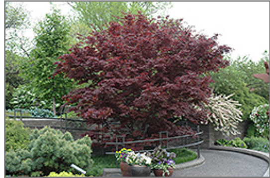
Bloodgood Japanese Maple