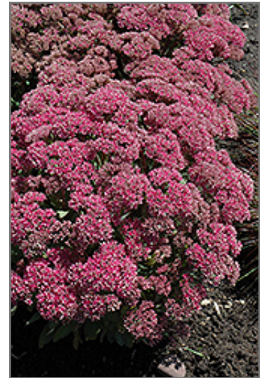
Mr. Goodbud Stonecrop flowers

Mr. Goodbud Stonecrop is recommended for the following landscape applications;