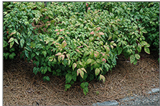
Fire Power Nandina

Moana Lane Garden Center & Corporate Office 1100 W. Moana Lane Reno, NV 89509 (775) 825-0600 (775) 825-0602 - Corporate Office